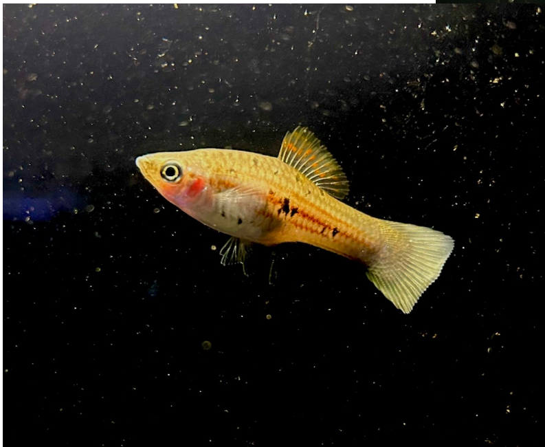
Left: A female x. alvarezi from the Clapsaddle line