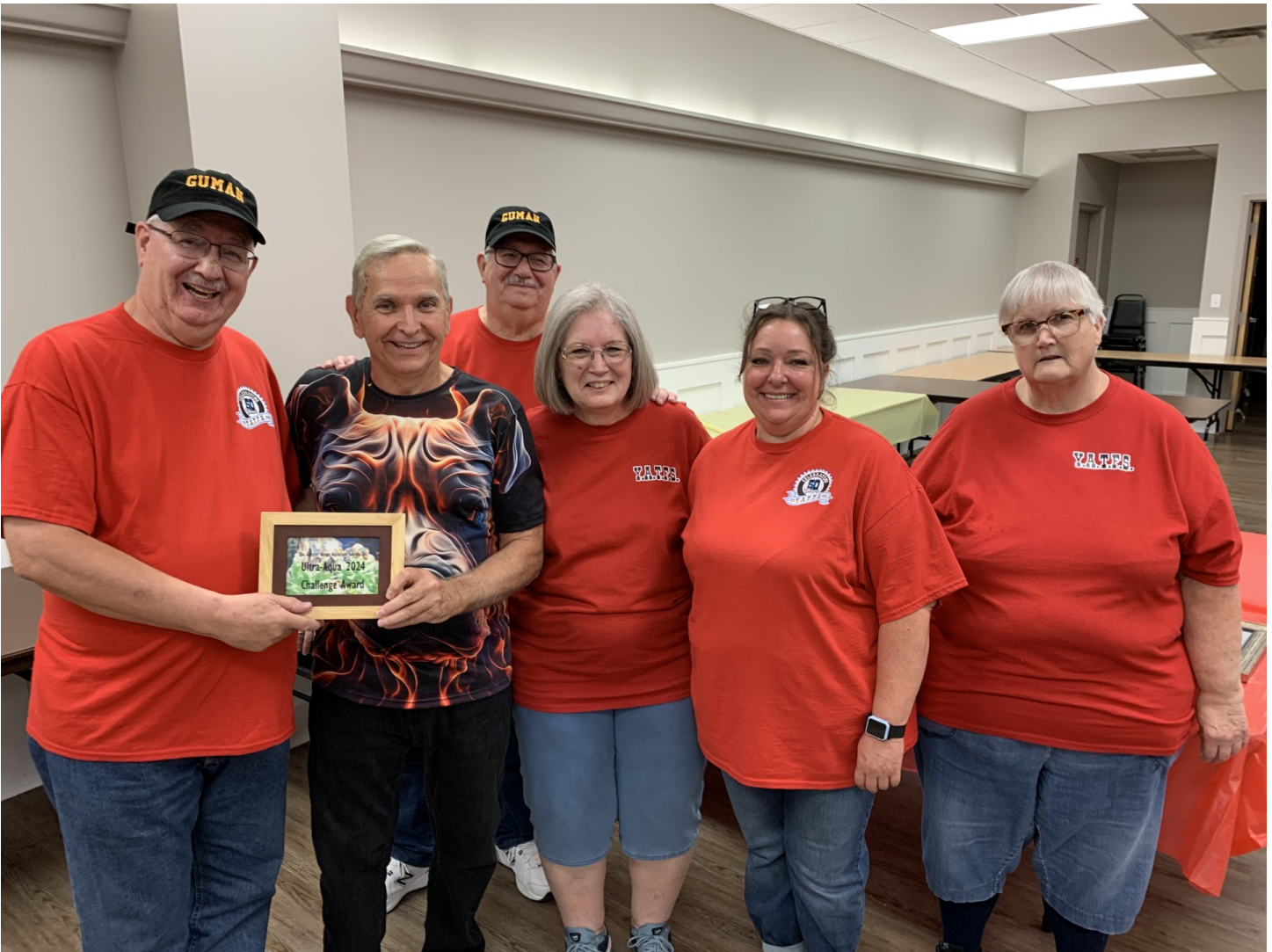
The Youngstown Area Tropical Fish Society wins this years Challenge Award.

Thank you to all who came from near and far to enter, judge and enjoy the Ultra-Aqua 2024!