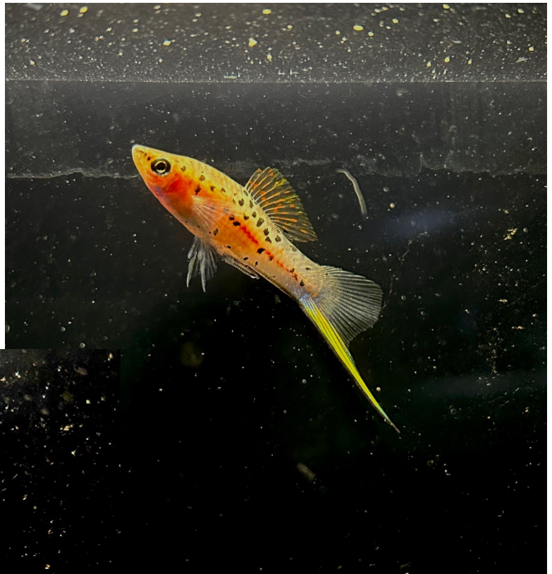
Right: A male x. alvarezi from the Clapsaddle line

While swordtails can be kept in 15- or 20-gallon tanks, wild populations of swordtails thrive best in breeder tanks that are 30 gallons or larger. Swordtails generally do well on flakes and freeze-dried diets, but frozen foods are also welcome. As with many swordtails, adults will chase fry at first, but the cannibalism lessens as the adults get used to juveniles in the tank.